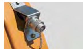
Front Electric/ Multi-Function