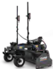
Laser Grading Box

All models come standard with a universal coupler that will work with numerous attachment manufacturers, meaning you can do more with a single machine to give your business even greater versatility. Consult your dealer for details.