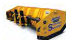
Arctic® Sectional Sno-Pusher™